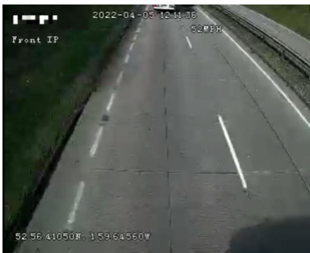
Poor Viewing Angle