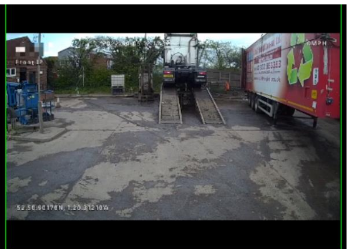
Correctly Adjusted Viewing Angle